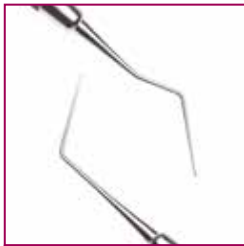
Explorer DG 16