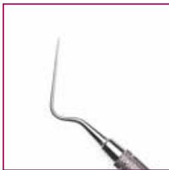
Spreader Wakai 1S