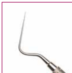
Plugger 8 1/2