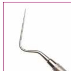
Plugger 9 1/2